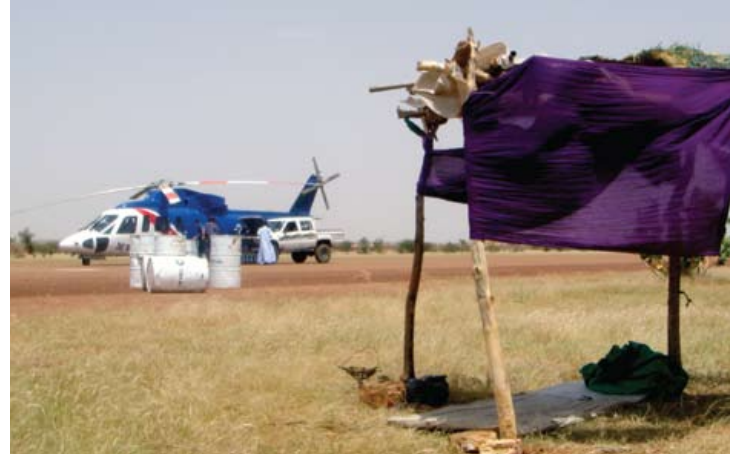
The flight from Norwich included an unorthodox refueling stop in Kiffa, Mauritania, before setting off for Bamako in Mali.