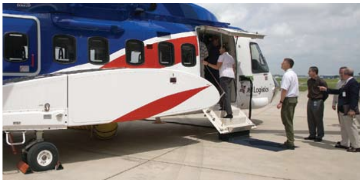
With the sale of small-engine aircraft, the Air Logistics focus is on helicopters like the S-92, introduced to customers last year.