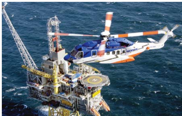
A Sikorsky S-92 arrives at a North Sea platform. Nine S-92s make up about 75 percent of the Bristow Norway fleet.

Current Clients: StatoilHydro, ConocoPhillips, BP Norge, Talisman Energy Norge, ENI Norge, Aker Exploration